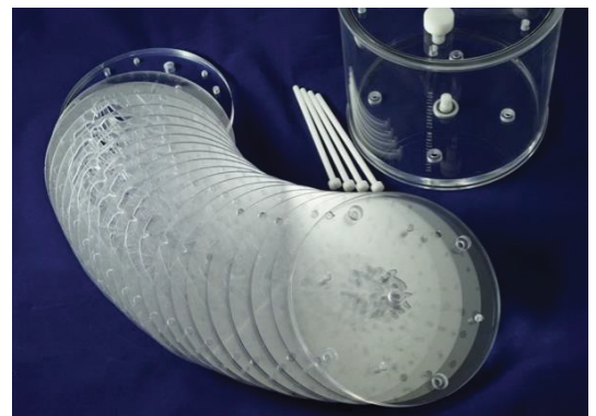
Components of 3D Brain Phantom™