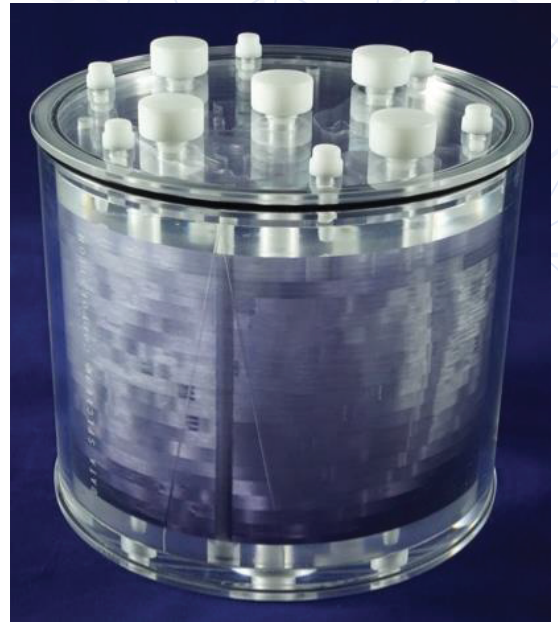
Hoffman 3D Brain Phantom™