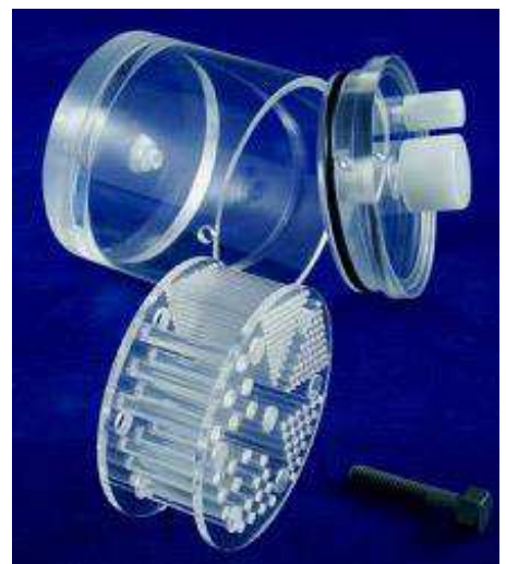
Components of Mini Deluxe Phantom™