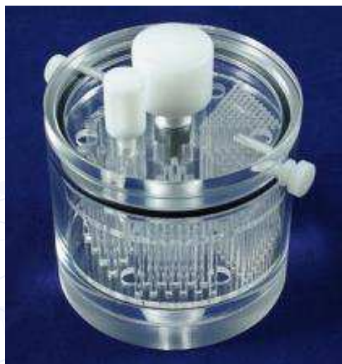
Mini Deluxe Phantom™