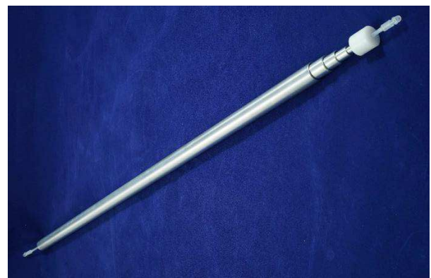
NEMA Sensitivity PET Phantom (NU 2-2018) ™