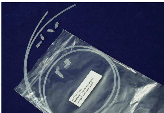
Tubing kit for NEMA Sensitivity PET Phantom (NU 2-2018) ™