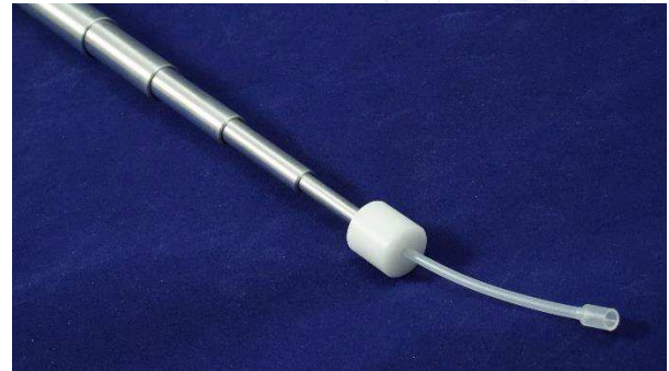
Close up of end of NEMA PET Sensitivity Phantom (NU 2-2018) ™