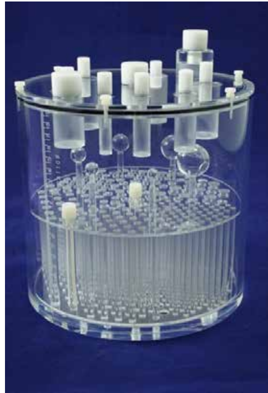
Flangeless Esser PET Phantom™