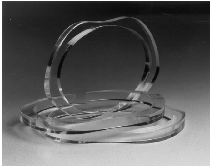
Body Contour Rings™