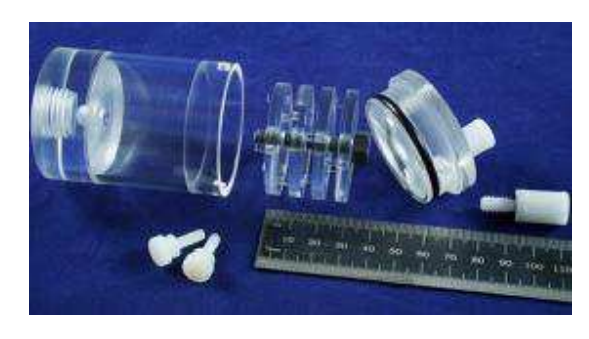
Components of Micro Defrise Phantom™