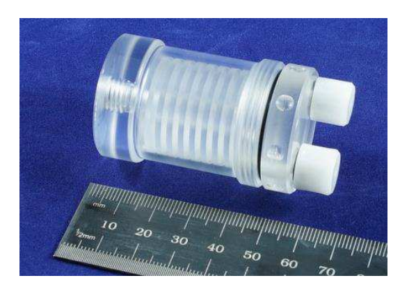
Ultra-Micro Defrise Phantom™