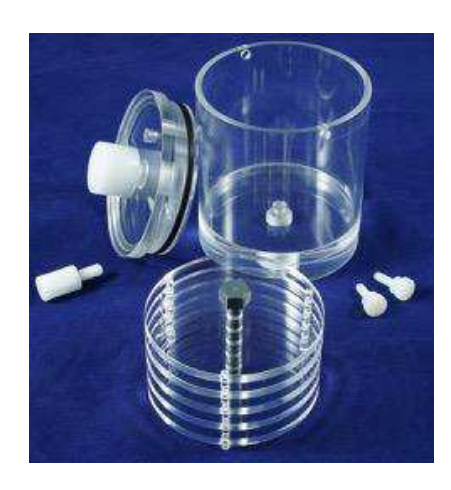
Components of Mini Defrise Phantom™