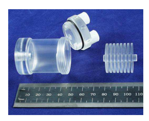
Components of Ultra-Micro Defrise Phantom™