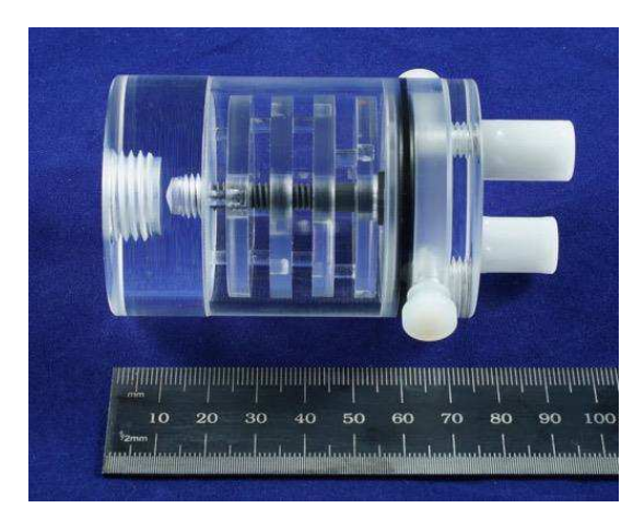
Micro Defrise Phantom™