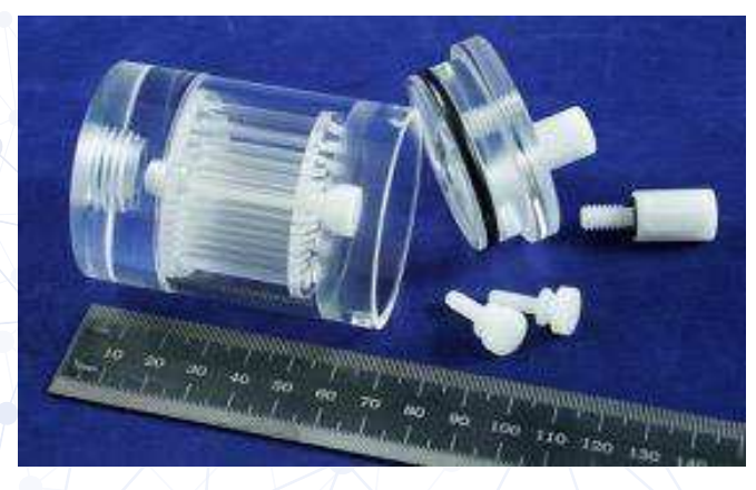
Components of Micro Deluxe Phantom™