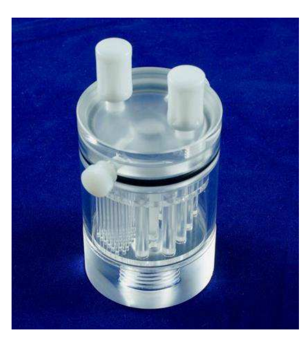
Micro Deluxe Phantom™